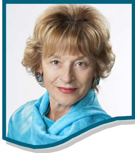
Speaker, Author, Educator and Therapist

info@takingflightbooks.com www.drjanesimington.com